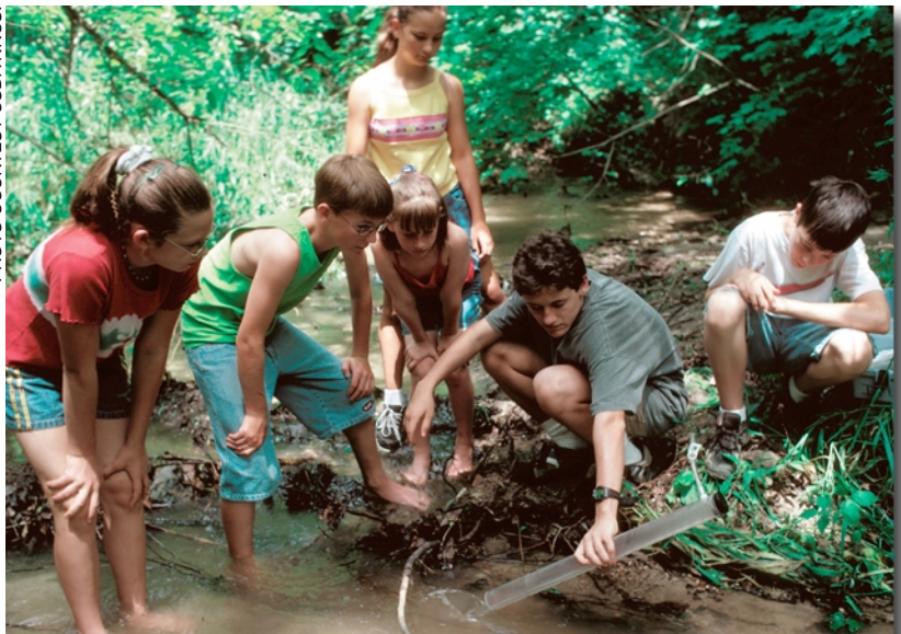
These volunteer monitors are collecting water samples from a small stream.